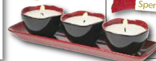
Three candle votives, £18, Rocha/John Rocha at Debenhams

Red teamed with black and gold is the epitome of an Oriental scheme. Try to add a few accessories around the room to complete the look