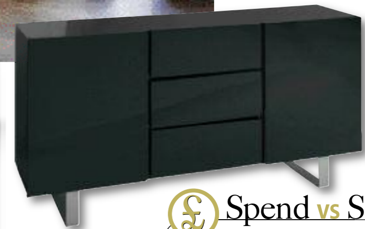
Black lacquered furniture really makes a huge statement