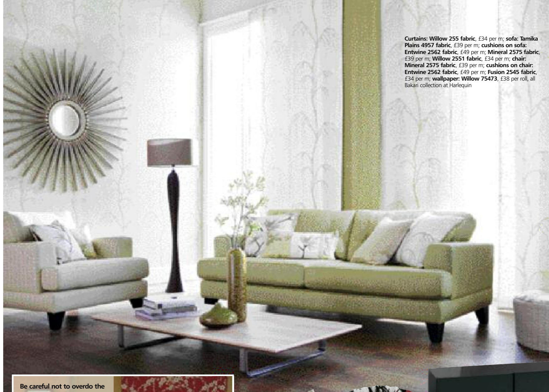
Curains: Willow 255 fabric, £34 per m; sofa: Tamika Plains 4957 fabric, £39 per m; cushions on sofa: Entwine 2562 fabric, £49 per m; Mineral 2575 fabric, £39 per m; Willow 2551 fabric, £34 per m; chair: Mineral 2575 fabric, £39 per m; cushions on chair: Entwine 2562 fabric, £49 per m; Fusion 2545 fabric, £34 per m; wallpaper: Willow 75473, £38 per roll, all Bakari collection at Harlequin

See Richard on the new series of 60 Minute Makeover on ITV1