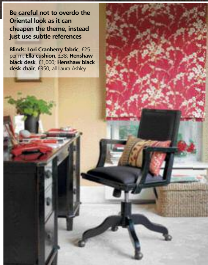
Blinds: Lori Cranberry fabric, £25 per m; Ella cushion, £38; Henshaw black desk, £1,000; Henshaw black desk chair, £350, all Laura Ashley

Be careful not to overdo the Oriental look as it can cheapen the theme, instead just use subtle references